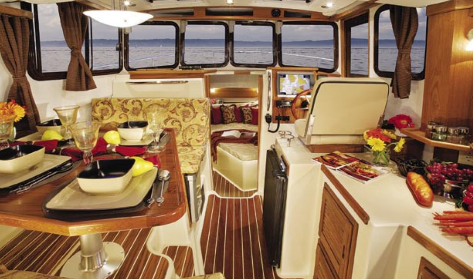
29' salon view forward from cockpit door

LOA. ....29' 0" ..... 8.9m w/ swim step .....33' 0" ..... 10.06m Beam .....10'0" ..... 3.05m Draft .....28" ..... .71m Displacement.....9,250 lbs.....4,196 kg